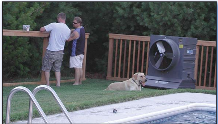
Pro-Kool® Evaporative Coolers can reduce air temperature by as much as 20°F!