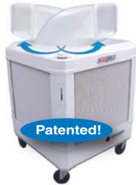
WC-1HPMFOSC Spout oscillates 120°